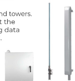
Example base station and antenna equipment