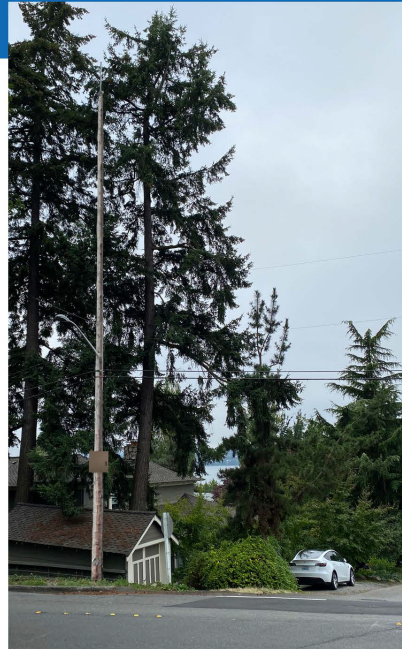
Rendering of 55-foot pole at West Mercer Way and 32nd Street.

The new metering system will transmit the water readings and other metering information to the data collection stations and the City. The data transmitted is encrypted and sent to the data collectors and the City through a secure, private RF channel. This technology does not share personal customer account information.